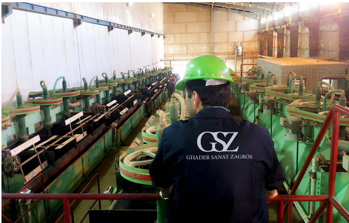
Sulfide and oxide lead and zinc concentration plant

We consider cost-effective, eco-friendly and user-friendly factors in our design with complete services for training, operating, maintenance and spare part supply.