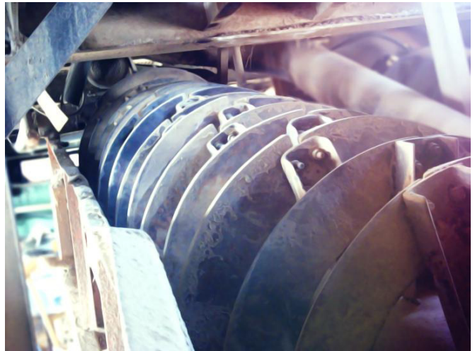
Two classifier that is made to separate particles more than 0.5 millimeter in HMS plant.

GSZ has developed an innovative techniques to determine the optimum feed size required for an efficient and enhanced gravity concentration. While 50 tph spiral classifier, manufactured to remove -0.5mm particles from dense medium separation and feed 50 tph Scrubber, installed in DMS circuits