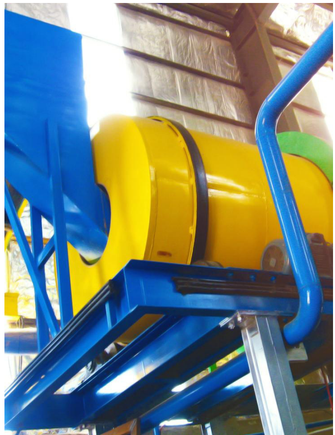
Scrubber that is installed in HMS process to scrub lead and zinc minerals for SADID co. [Iran,Zanjan]