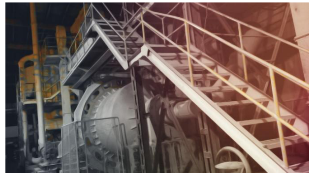
Ball mill that is used for hard mineral grinding in SETABRAN company.