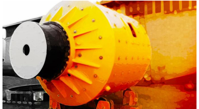
Ball mill that is made for grinding circuit in flotation process

Each of the different types of grinding mills are available in a variety of sizes, drives and liner types and configurations at highest quality to meet the client's requirements.