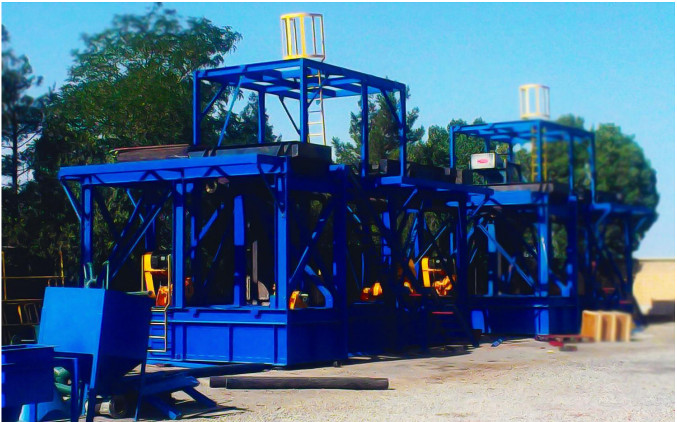
Two Modules of heavy media for Lead and Zinc Pre-concentration - 30tph

We design and simulate complete process that assures our customers to get high recovery and performance from their modular plant.