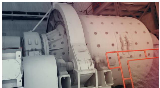
Ball mill that is designed for grinding circuit in ILZIMCC flotation plant. [Iran,Zanjan]